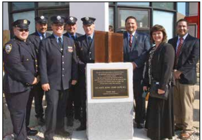
It was my pleasure to join members of the Nanticoke Fire Department and the New York Fire Department at a 9/11 Memorial dedication.

The Pennsylvania Fish & Boat Commission has announced this year's Fish-for-Free days. On Sunday, May 29, and Monday, July 4, anyone can legally fish on any Pennsylvania waterway without a fishing license. All other fishing regulations still apply.