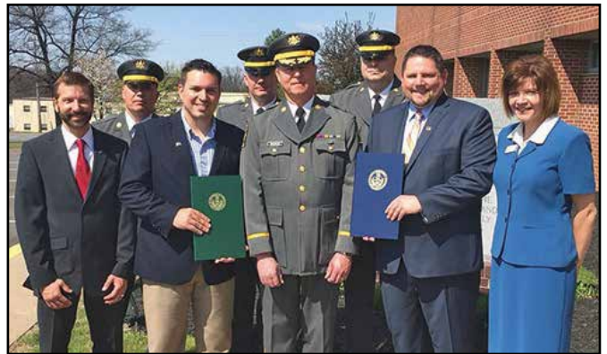
PSP-Hazleton, Troop N was recently recognized for 110 years of service. I was honored to participate in its memorial program.