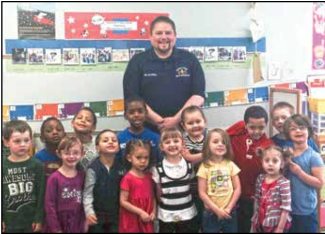
I always enjoy participating in Head Start's "Reading Adventure" Program.

If your child doesn't have health insurance, or if you know of a child who isn't covered, you can find out more about CHIP, including providers in the area, and how to enroll at www.chipcoverspakids.com or by contacting my office.