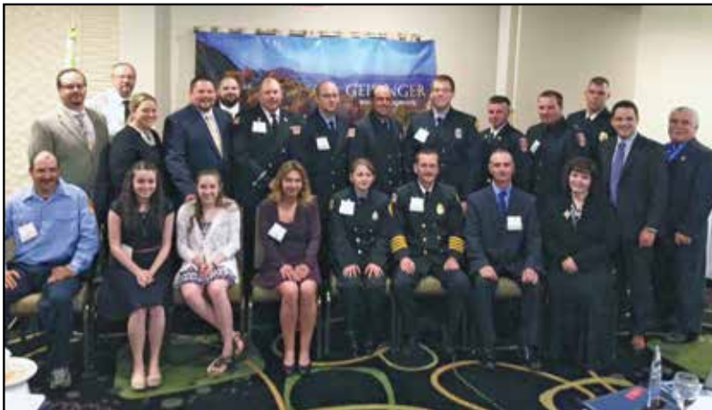
Several hometown heroes were honored at the Red Cross Heroes breakfast.

A recent EPA study found that residential property values increased by more than 7 percent once a nearby brownfield was cleaned up.