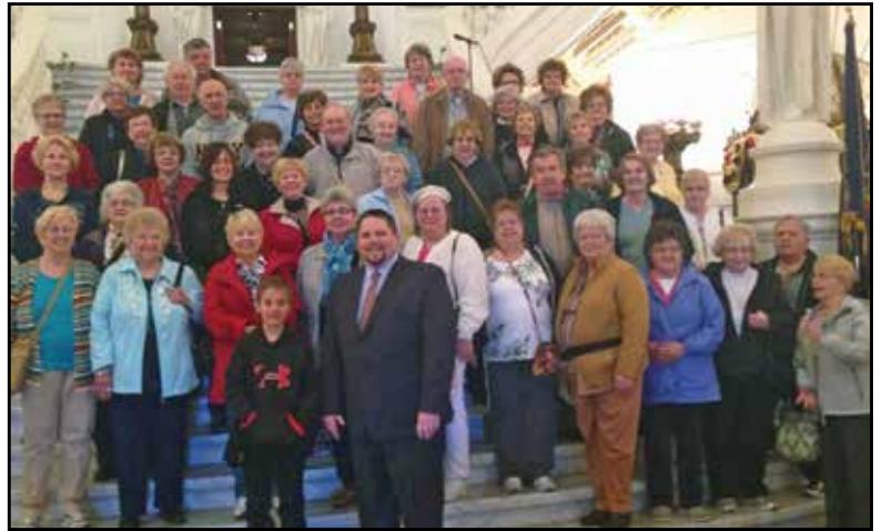
Constituents from the Freeland Senior Center enjoyed a recent tour of the Capitol.